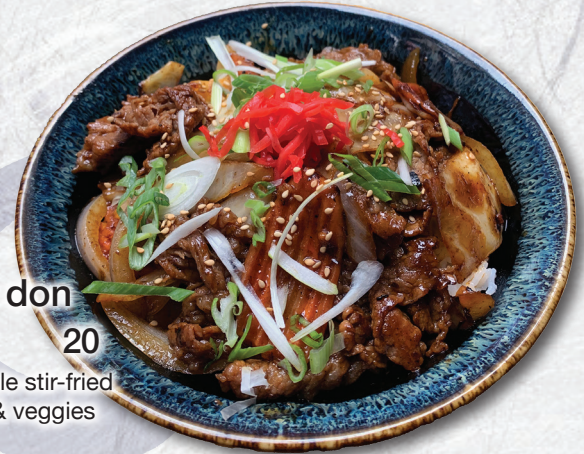
Yakiniku don 焼肉丼 20 Japanese style stir-fried brisket beef & veggies over rice

Sausage (3pcs) Fried shrimp (3pcs) Karaage (4pcs)