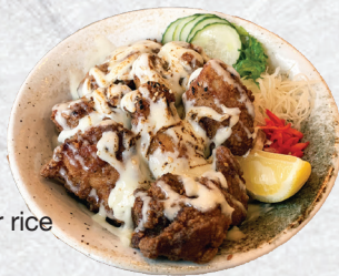
Snow Chicken Don スノーチキン丼 18 Japanese style boneless fried chicken w/cheese & mayo over rice