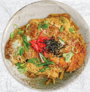
Katsu don カツ丼 16 Simmered Pork or Chicken cutlet & egg over rice