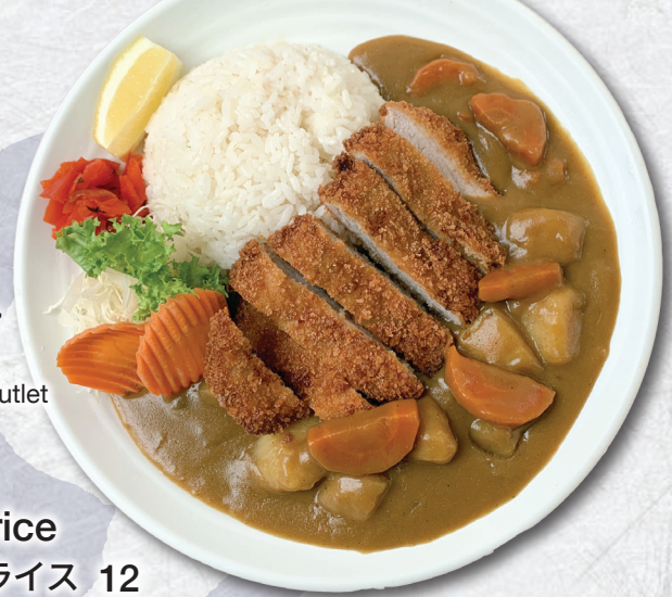
Katsu Curry カツカレー 17 Japanese curry rice w/ Pork or Chicken cutlet