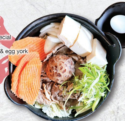
Sukiyaki すき焼き 24 Japanese traditional special sweet soy-based sauce w/beef, tofu, vegetable & egg yolk

FOOD ALLERGY NOTICE : PLEASE ALERT YOUR SERVER IF YOU HAVE ANY ALLERGIES !!