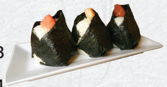
Onigiri (1 pc) おにぎり Plain 3 Salmon / Plum 4 Konbu / Mentaiko 4