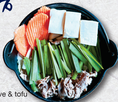
Beef nabe 牛鍋 22 Beef hot pot w/vegetable, chive & tofu