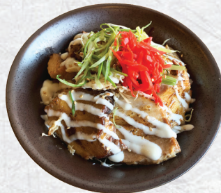
Chashu don チャーシュー丼 16 Braised pork belly over rice w/ mayo